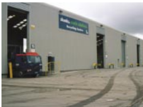
Existing MRF at Blochairn, Scotland

The waste is separated out into recyclable and other usable parts. Steel and aluminium are extracted for recycling, while glass and stones are removed for use as construction